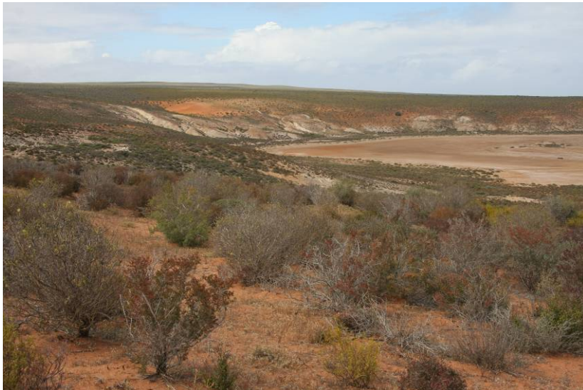
FIGURE 2b. The edge of the Sout River floodplain