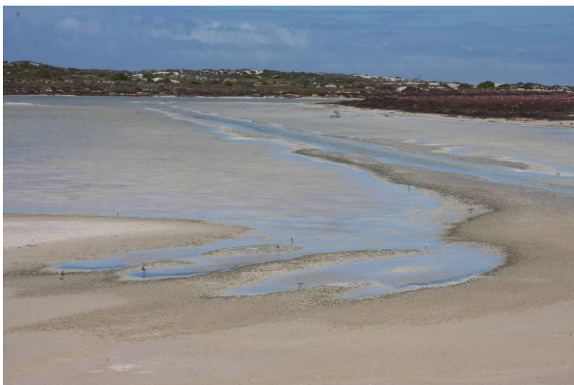
FIGURE 2c. The Sout River just upstream from the salt pans at Rietfontein. Most of the avian diversity in the WEF area is focused on the river mouth.