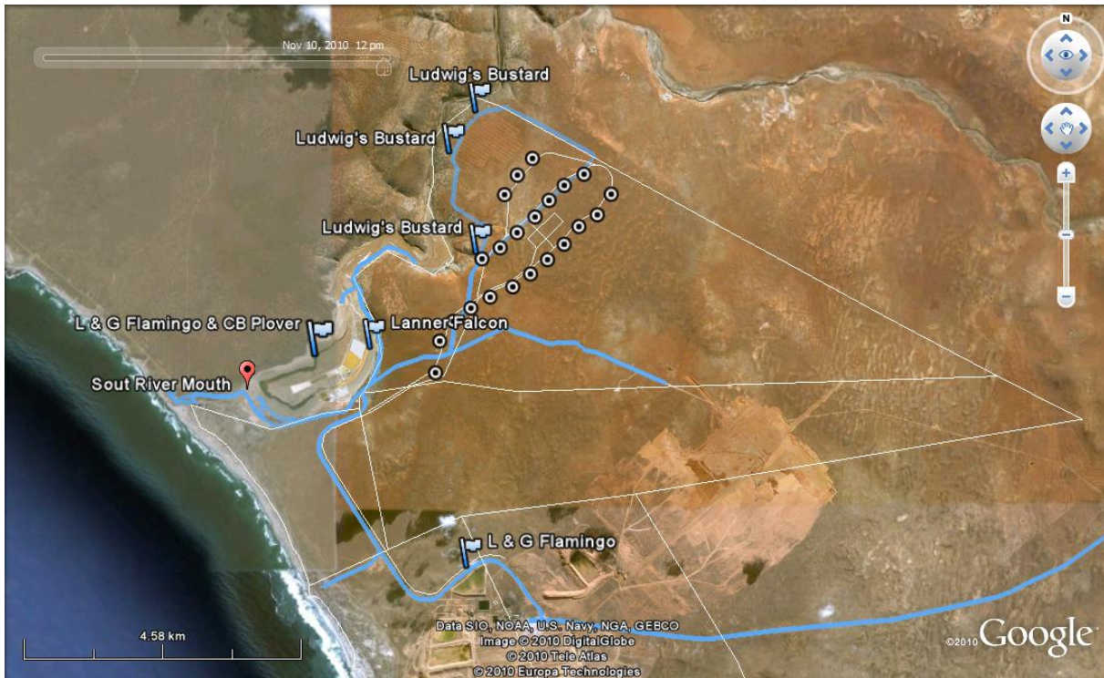
FIGURE 4. Area coverage (blue lines) and the distribution of significant sightings made during the November site visit, in relation to the proposed turbine array (white circles).

On the basis of these on-site observations, and in combination with the available SABAP atlas data for the general area, 9 priority species are recognised as key in the assessment of avian impacts of the proposed Exxaro West Coast Wind Energy Facility (Table 2), and as suitable surrogates for impacts on other species. These are mostly nationally and/or globally threatened species which are known to occur, or could occur in relatively high numbers in the development area and which are likely to be, or could be, negatively affected by the wind energy project. Some (in particular Ludwig's Bustard, Chestnut-banded Plover, Black Harrier, Martial Eagle, Lanner Falcon) are either known or likely to breed in the general area, while others (flamingo spp., Great White Pelican) occur as visitors only. All are likely to be sporadic in their occurrence, with influxes correlated with good rains.