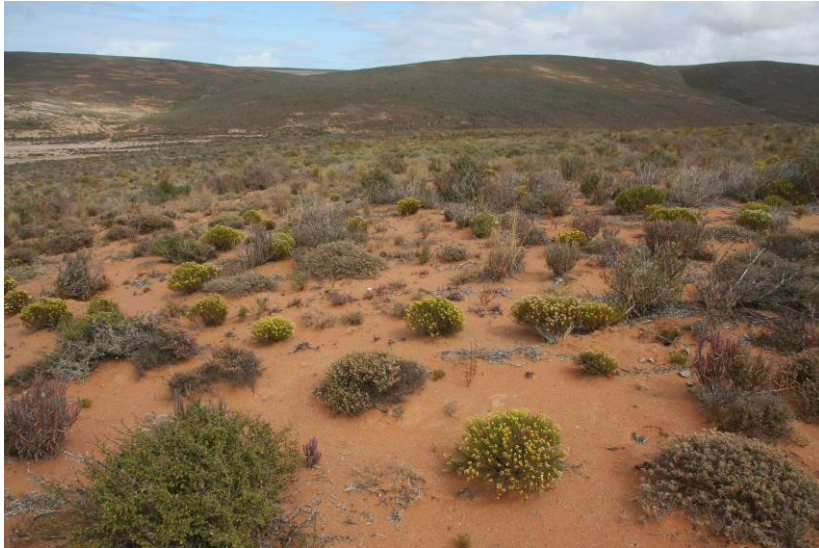
FIGURE 2a. Undulating Strandveld on Soutvlei se Duin, south-east of the Sout River, where most of the Exxaro West Coast WEF turbines will be located.