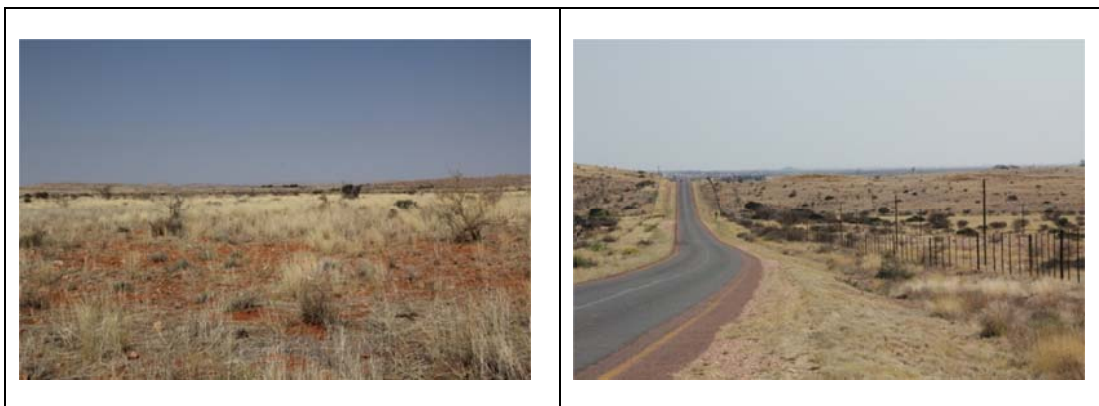
Fig. 2. Views over the study area.