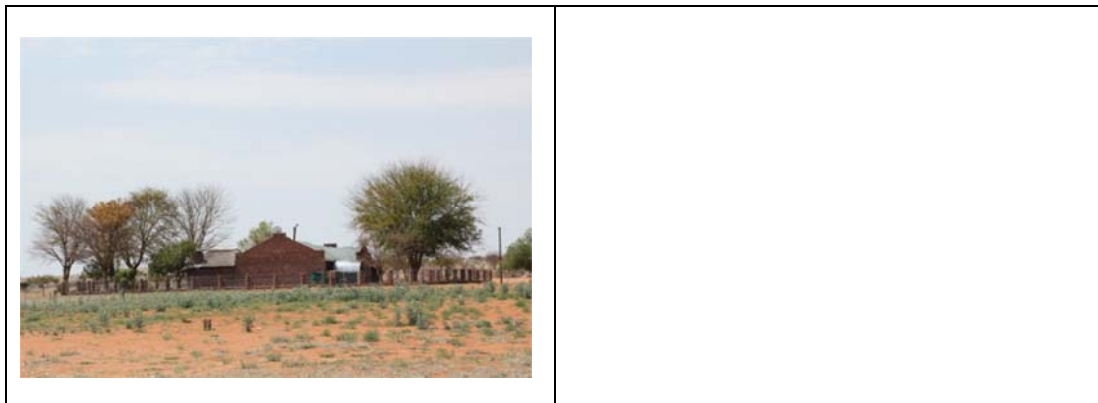
Fig. 4. Examples of farmsteads and farming related features in the region.