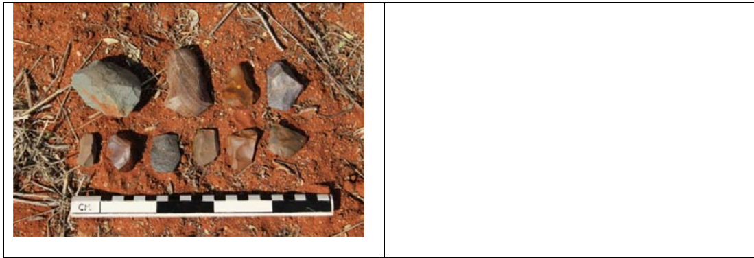
Fig. 6. The stone tools that were identified.