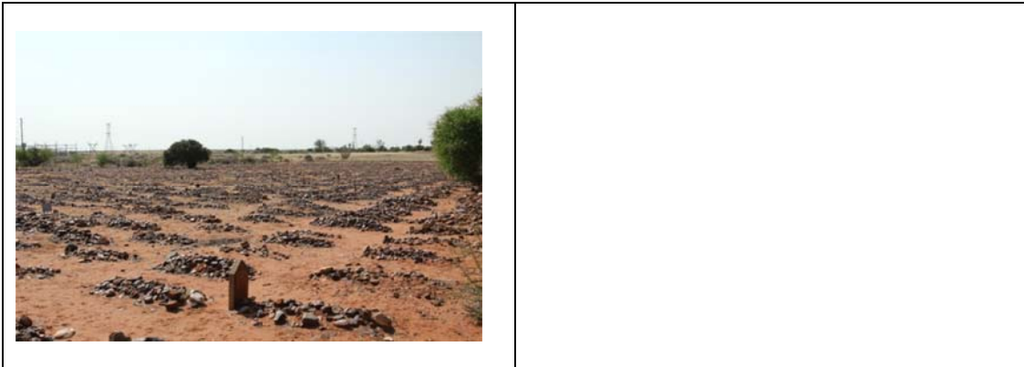
Fig. 5. Example of a cemetery identified in the region.