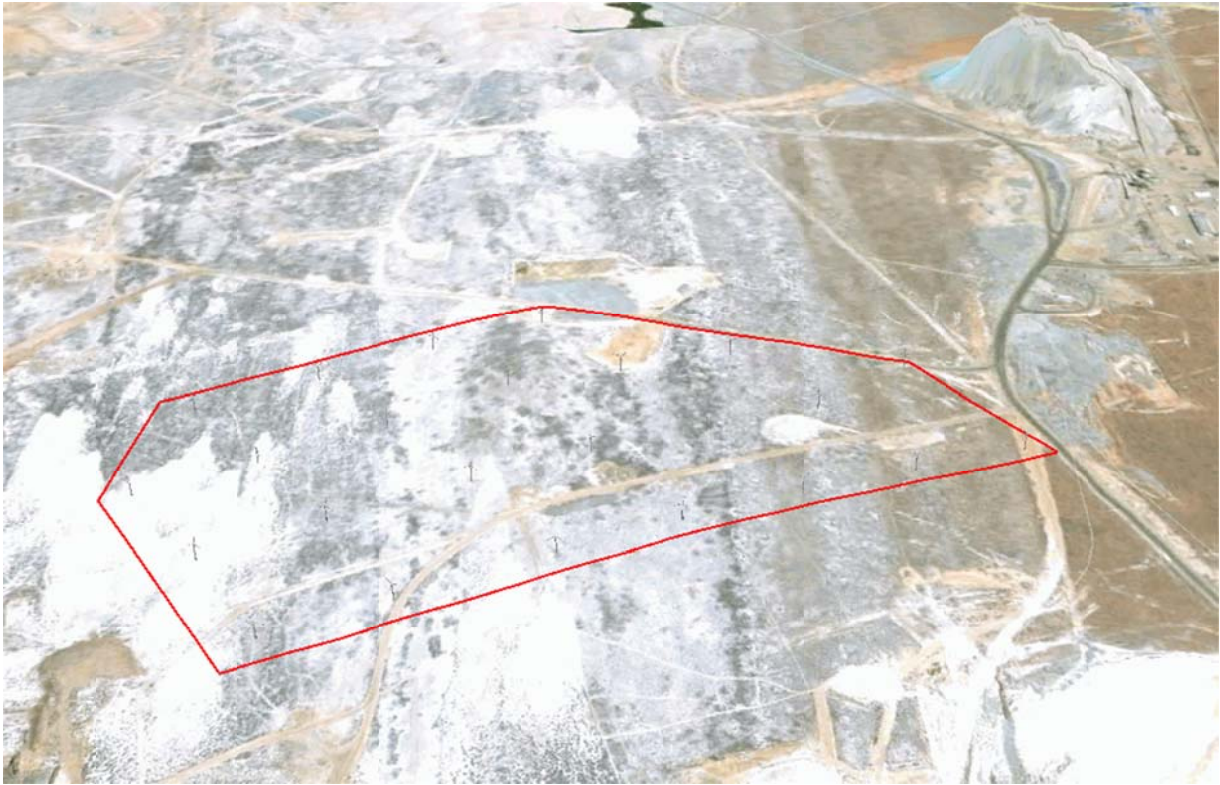
Figure 7. Koingnaas Just Palm Tree Power project area in simulated oblique aerial view looking northwards. Google Volfkop

This small project area (Figure 7) is mainly between elevations of 40 to 60 m asl. and is situated on the bedrock high that crops out as the gentle hill of Wolfkop in the north-central part, where the bedrock is thinly covered between 60-70 m asl. Thin, residual marine deposits lap around Wolfkop (early Pliocene Avontuur Formation). The marine deposits seen in nearby mine pits are decalcified (personal obs.), but petrified fossils occur. However, the marine beds are overlain by terrestrial deposits and ~1 m of calcrete and are not expected to be intersected in most shallow excavations <1 m deep.