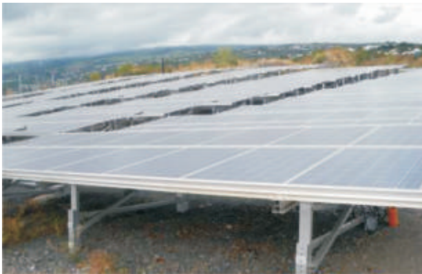
Figuur 1: Foto van 'n fotovoltaïese sonkragaanleg

Die FV-panele is ontwerp om vir meer as 20 jaar ononderbroke, onbeman en met min instandhouding te funksioneer.